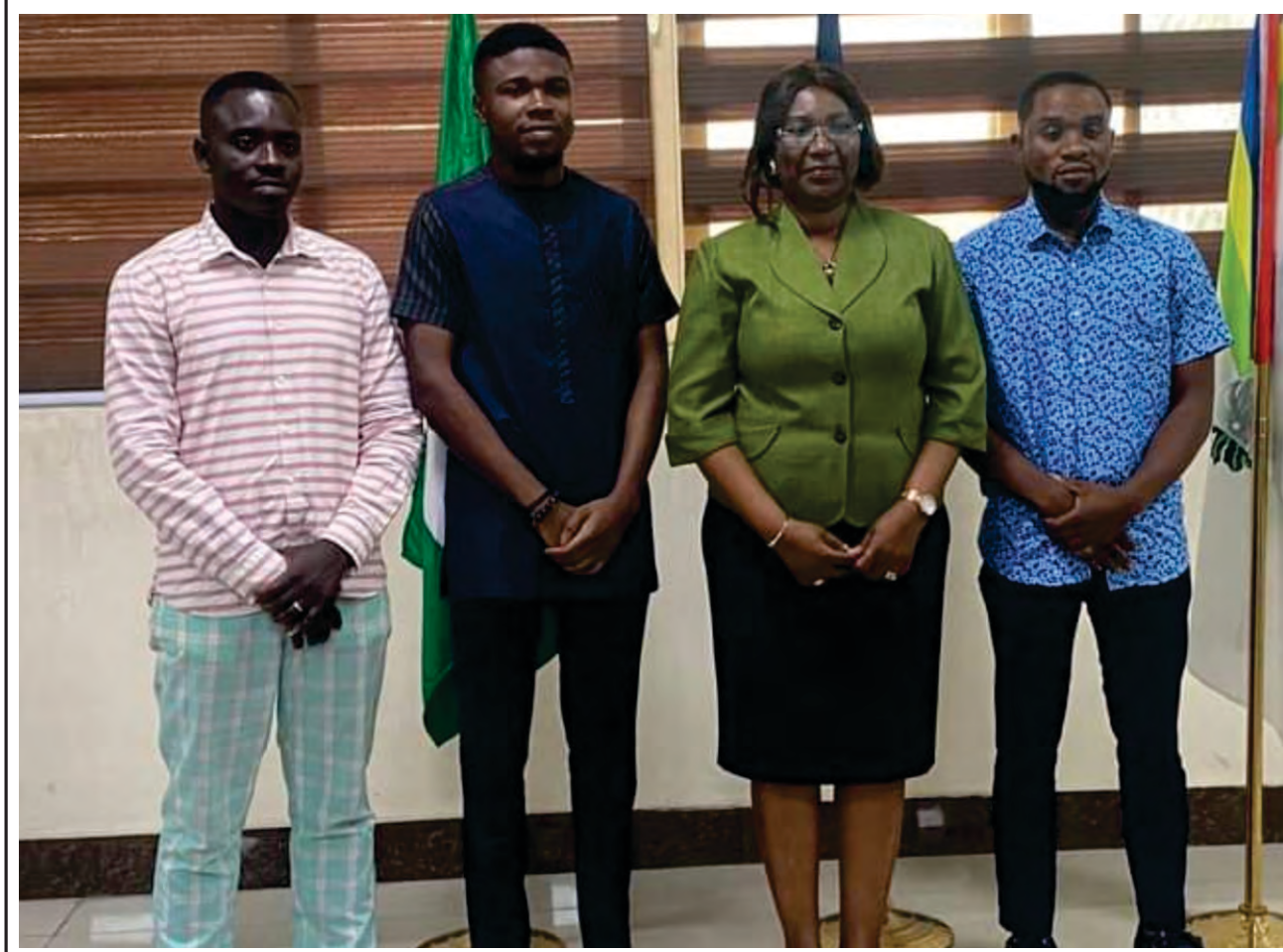
LASU Vice-Chancellor in a group picture with newly admitted Masters students

She noted that their PhD counterparts would resume later in the month.