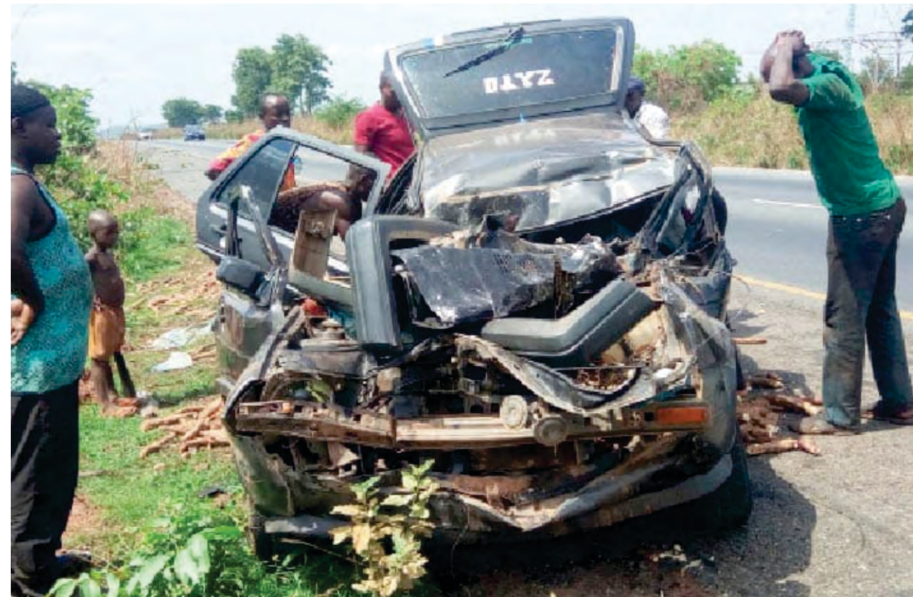
The scene of the accident

"The vehicles have been evacuated from the road with the agency's super metro. The operation has been concluded," he said.