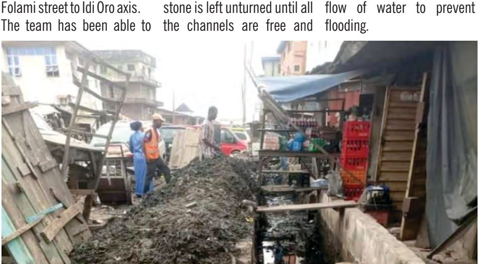
Clearing of drainage channels in Idi Oro Mushin

The exercise which started about a week ago has almost been completed as the council boss mandated the team to evacuate all blockades in the drainage channels from Isolo road to Idi Oro, along the Agege Motor road and ensure that no